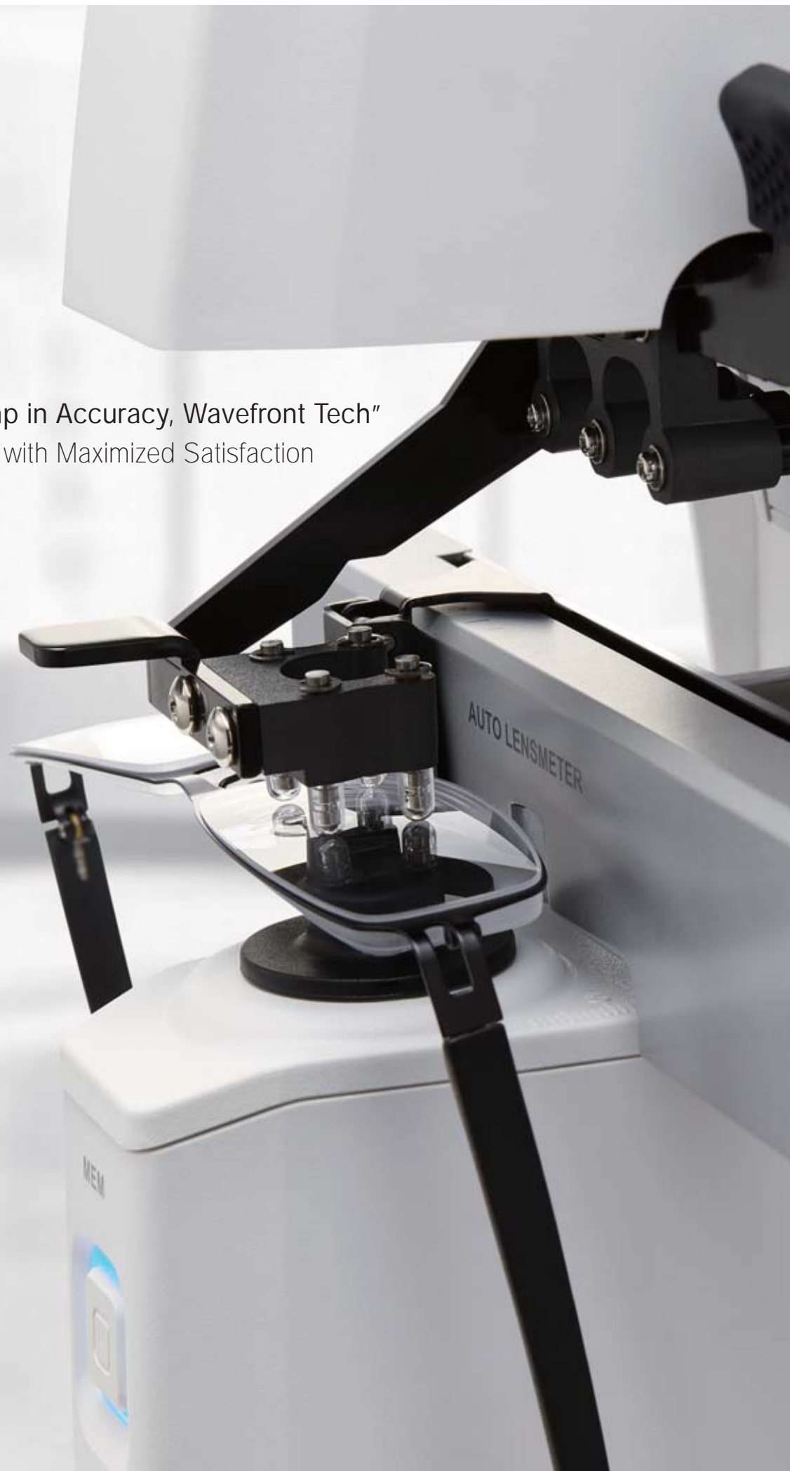
Hartmann Sensor Blue Light Hazard Measurement

“Another Jump in Accuracy, Wavefront Tech” Reliable Data with Maximized Satisfaction