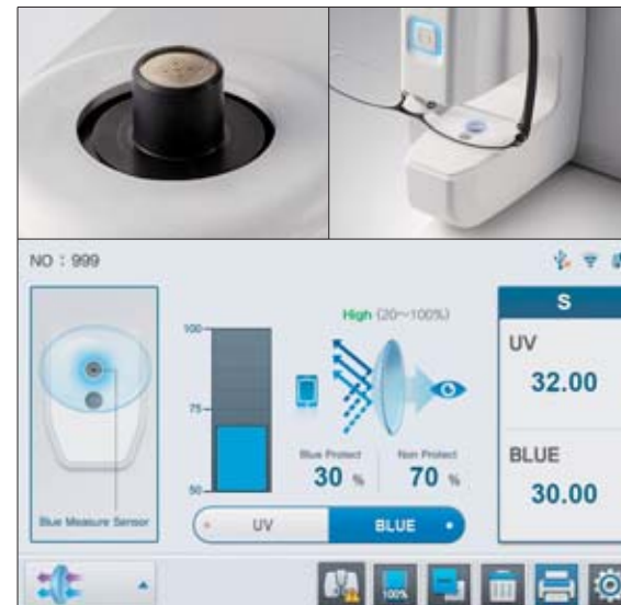
Blue Light Hazard and UV Measurement