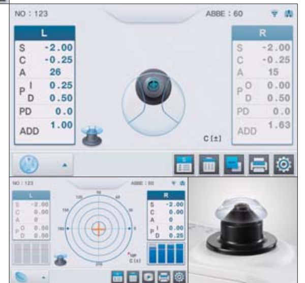
Contact Lens Measurement