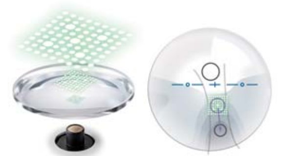
Hartmann Sensor / Green Light Beam(540nm)

Implementation of Hartmann Sensor Wavefront Analysis Technology with more measuring spots maximizes accuracy in measurement even for multi-focal and high curved lenses.