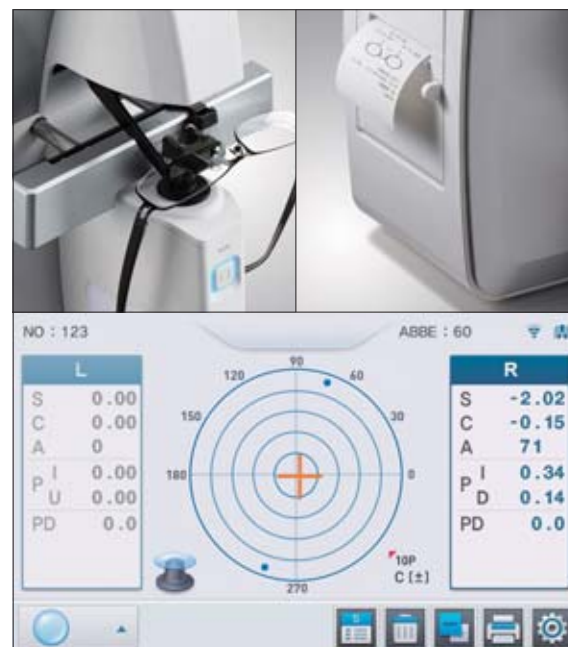
User-friendly Graphic Interface